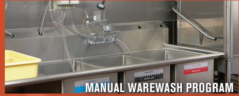
MANUAL WAREWASH PROGRAM