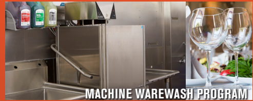
MACHINE WAREWASH PROGRAM